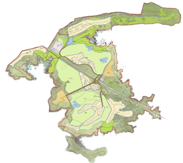
MONSARAZ NAUTICAL, GOLF & RESIDENCES RESORT MASTERPLAN